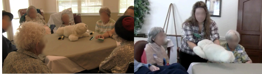
Fig. 2. (A) Initial interaction setting. (B) Therapist mediated interaction.

To begin the PARO interaction, the therapist put PARO in front of the resident or on their lap. When two or three people wanted to interact with PARO simultaneously, PARO was set up on the table between them or the people were moved closer together. When PARO was near the targeted participant, the therapist encouraged interaction by petting or stroking the robot in front of them and initializing conversation about PARO, saying things like “Do you remember it?” “Isn’t it cute?” “What do you think about it?” Besides mediating interaction with the targeted participants, sometimes the therapist shifted to others in the group and talked to them about PARO from a distance. When the interaction was mediated in this way, participants were more willing to communicate with each other and interact with PARO. These results are in line with Wada’s [8] findings on the need for caregivers to scaffold PARO’s use in particular ways for it to have a therapeutic effect, but differ in relation to Wada’s statement that the handler’s facilitation is required because PARO is unable to move by itself. In our observation, the mediator’s role was much more important. Although PARO raised participants’ interest and became a topic of conversation, older adults still had trouble initiating and continuing conversation without mediation by the therapist due to their cognitive and physical impairments.